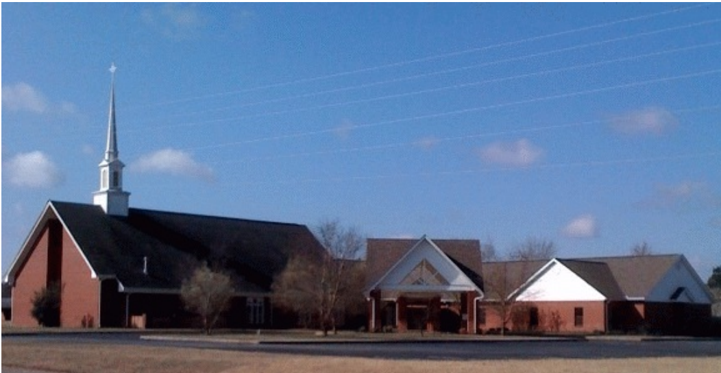
Trinity and Ridgway