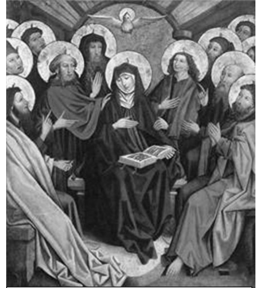
A 15th century German depiction of Pentecost.

The notion of Easter as a season of 50 days ending at Pentecost is patterned after the ancient Jewish festival of seven weeks that extended from the beginning of the barley harvest (on the second day after the beginning of Passover) to the end of the wheat harvest at the Festival of Weeks or Shavuot (see Deuteronomy 16:9-12). The Festival of Weeks later came to be called Pentecost ("50th day") by Greek speaking Jews. In Jewish tradition, Shavuot also marks the giving of the law to Moses at Sinai; this liturgical link may inform Paul's discussions of the law and the Spirit (see Romans 8, 2 Corinthians 3 and Galatians 3).