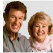
Gloria and William J. Gaither

The words were written by two of the longest-lasting performing couples of Christian contemporary music, Gloria (b. 1942) and William J. (b. 1936) Gaither. “Because He Lives” was awarded the recognition of Gospel Song of the Year for 1974 by the Gospel Music Association and the American Society of Composers and Publishers (ASCAP).