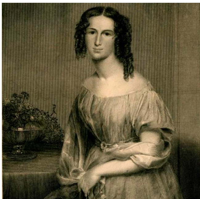
Isabella Graham, circa 1770.