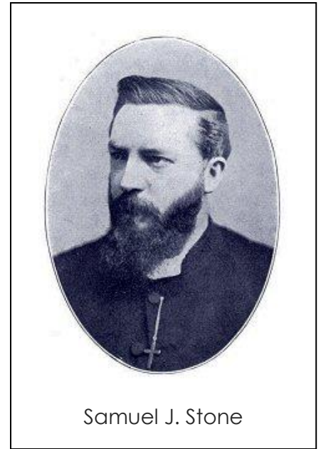
Samuel J. Stone

Ultimately, the polemical use of the hymn outweighed its pastoral intent. A skilled poet, Stone wrote a sarcastic “Soliloquy on a Rationalistic Chicken” in three stanzas that refutes any attempt to grapple with the scientific and philosophical views of his day. In the earlier stanzas, the chicken asks several questions: “How did I get in there?” followed by “Where was I of yore?”, and concluding with “Why didn’t I get out before?” The concluding stanza follows: